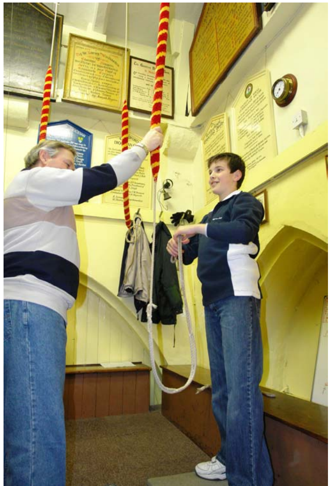
Learn how to ring a bell